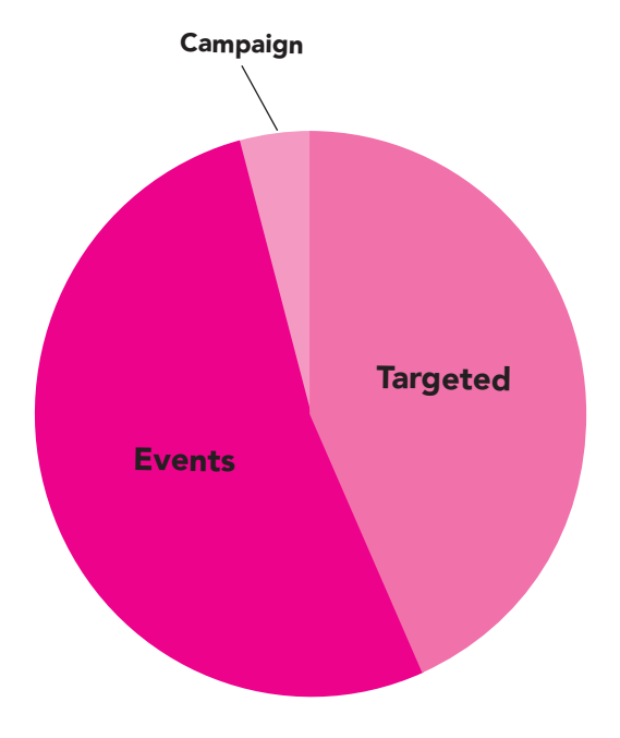
Total Revenue FY21: $566,194